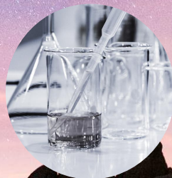
pharma & healthcare