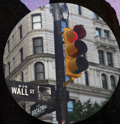
banking & insurance