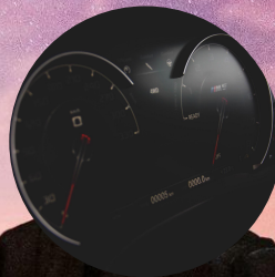
automotive & aviation