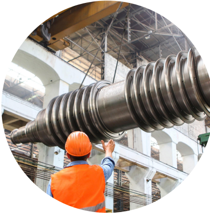
Emissions reductions in manufacturing