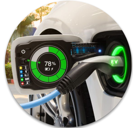
Electricity grid optimization