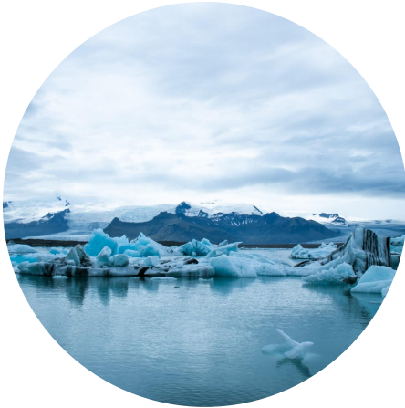
Monitor Ice Sheet dynamics