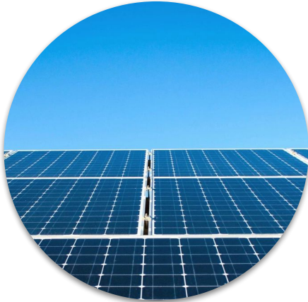
Cost reductions in renewables