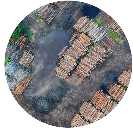
Track deforestation & Land Use